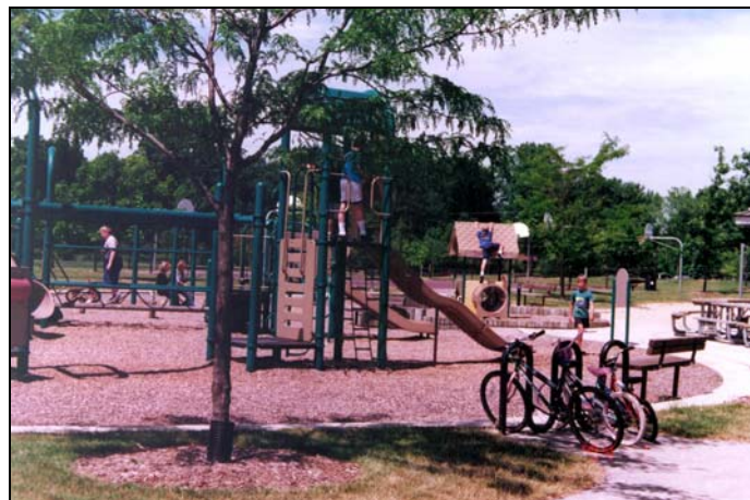
Table 11 breaks down costs in 2003 dollars to develop the desired range of facilities in each mini park recommended in this Plan . Again, these mini park facility and equipment costs are compiled from previous Village expenditures on similar types of equipment or infrastructure improvements, or are derived by reviewing park expenditures from other Wisconsin communities. These base costs represent average expenditures, and may vary depending upon a variety of factors. Based on the data presented in Table 11, the Village should budget $25,300 to develop each new mini park.

This Plan recommends eight mini parks with specialized facilities that serve a concentrated population or specific group such as pre-school and elementary school age children or senior citizens. These parks should be easily accessible to the surrounding neighborhood and are developed with playground structures ( as represented in the photo below ).